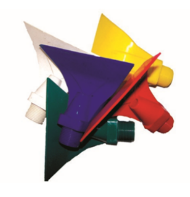
*All have 3/4" BSP Thread